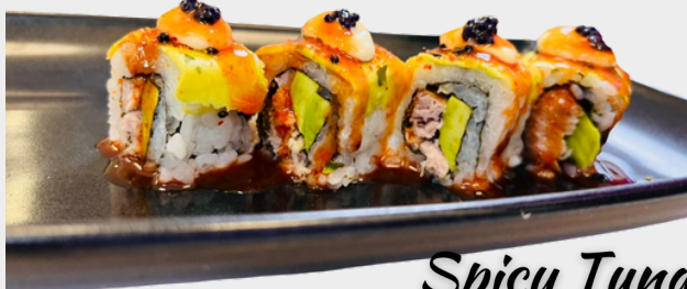
Spicy Tuna Roll