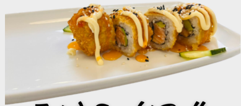
Fried Sushi Rolls