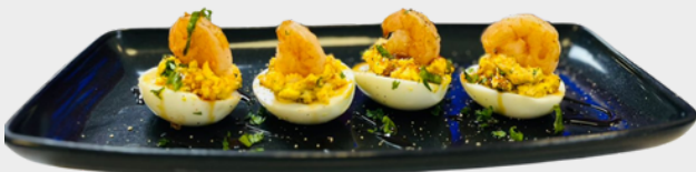
Shrimp Deviled Eggs

2 boiled eggs cut into 2Ps, yolk mixed with mayonnaise, sugar, black pepper coriander, paprika, topped with fried shrimp garnish with parsley and spring onion N$70