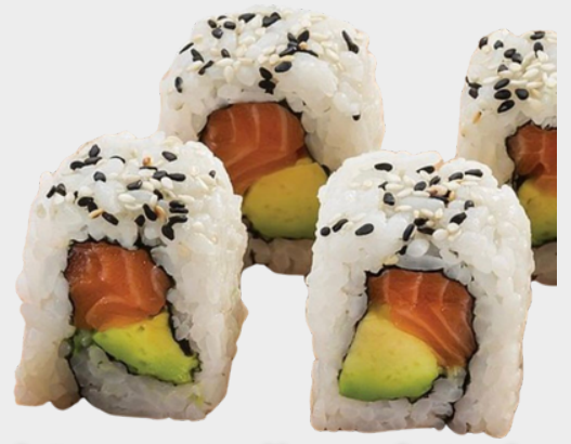
California Rolls with Salmon